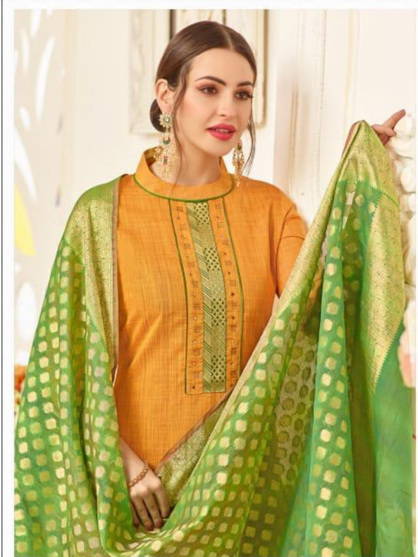
▶ WHEN WE CHOSE TO TAKE INSPIRATION FROM INDIAN BEAUTY, THE RESULT IS HERE A SET OF VIVID COLOURFUL GOWNS TOLD A STORY ABOUT GREAT FASHION AND TRENDS ▶