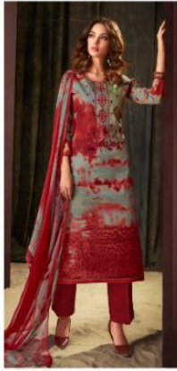
STYLE No. 53004