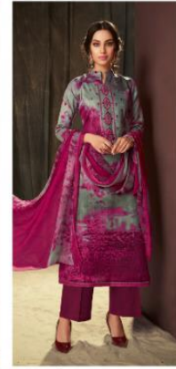
STYLE No. 53009