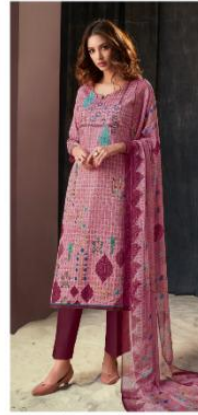
STYLE No. 53005