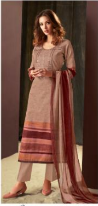
STYLE No. 53001