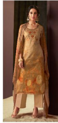
STYLE No. 53008