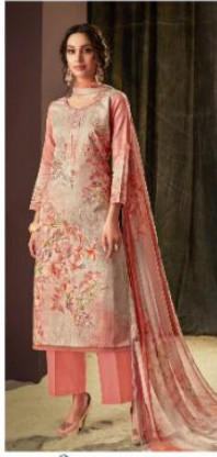
STYLE No. 53003