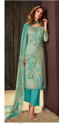
STYLE No. 53007