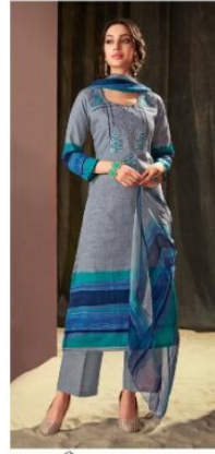
STYLE No. 53006