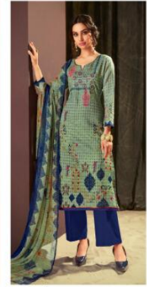
STYLE No. 53010