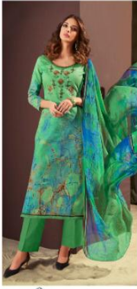
STYLE No. 53002