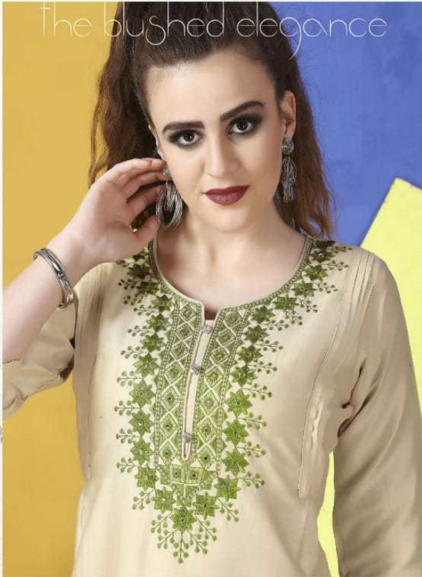
Beautiful myriad of colours for the celebration of upcoming festive season for the stunning & beautiful Ladies of all ages keeping in mind the affordability factor.