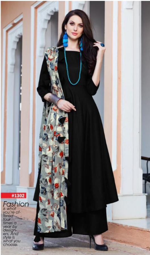
#1302 Fashion is what you're offered four times a year by designers. And style is what you choose.