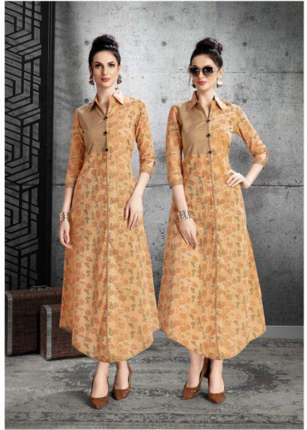
D.no. - 1003

The magnificent and majestic cliffs in the distance. The great embrace of the river. The perfect carpet of the lush, verdant grass. A truly special atmosphere. And the women in the same an integral component of this realm. Welcome to the land of perfection.