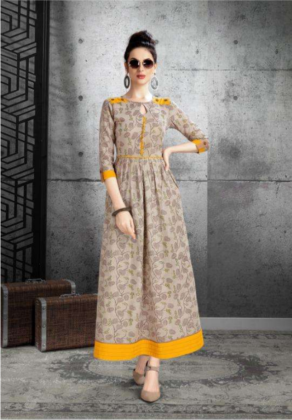
D.no. - 1006

The magnificent and majestic cliffs in the distance. The great embrace of the clear. The perfect carpet of the lush, verdant grass. A truly special atmosphere. And the women in the scene an integral component of the scene. Welcome to the land of perfection.