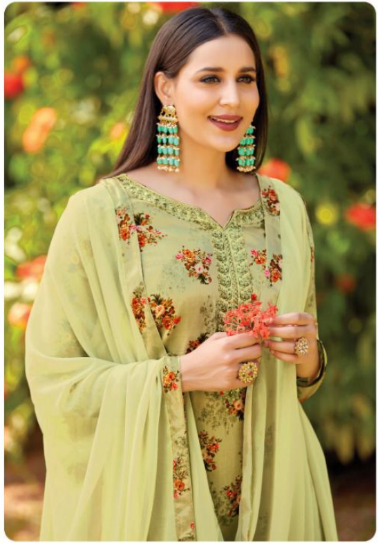
expression of a diva are truly engrossing , her unique expression would carry attention in any celebration elegance carried by her is truly adorable.