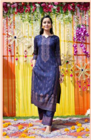
C1003 - Navy blue colour kurli and parallel palazzo pants set with unique cross-effect pattern gold print on kurli (front, back & sleeves) and palazzo (bottom flat). Fabric: 140% rayon, Palazzo with pocket.