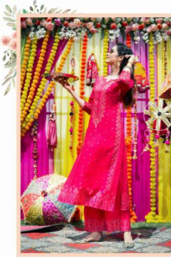
C1001 - Gajeri colour kurli and parallel palazzo pants set with unique cross-effect pattern gold print on kurli (front, back & sleeves) and palazzo (bottom flat). Fabric: 140% rayon, Palazzo with pocket.