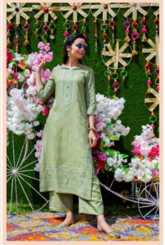
C1005 - Sage green colour kurli and parallel palazzo pants set with unique cross-effect pattern gold print on kurli (front, back & sleeves) and palazzo (bottom flat). Fabric: 140% rayon, Palazzo with pocket.