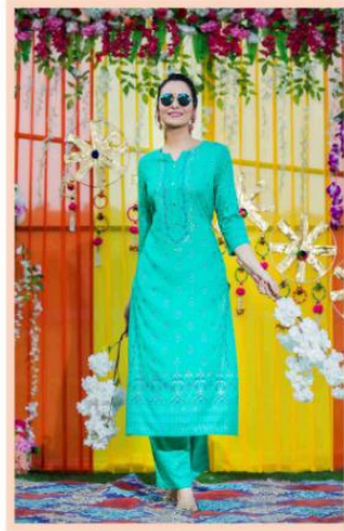
C1006 - Burnt orange colour kurli and parallel palazzo pants set with unique cross-effect pattern gold print on kurli (front, back & sleeves) and palazzo (bottom flat). Fabric: 140% rayon, Palazzo with pocket.