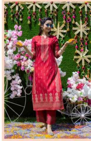
C1004 - Dark red colour kurli and parallel palazzo pants set with unique cross-effect pattern gold print on kurli (front, back & sleeves) and palazzo (bottom flat). Fabric: 140% rayon, Palazzo with pocket.