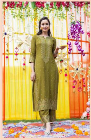
C1002 - Mehndi green colour kurli and parallel palazzo pants set with unique cross-effect pattern gold print on kurli (front, back & sleeves) and palazzo (bottom flat). Fabric: 140% rayon, Palazzo with pocket.