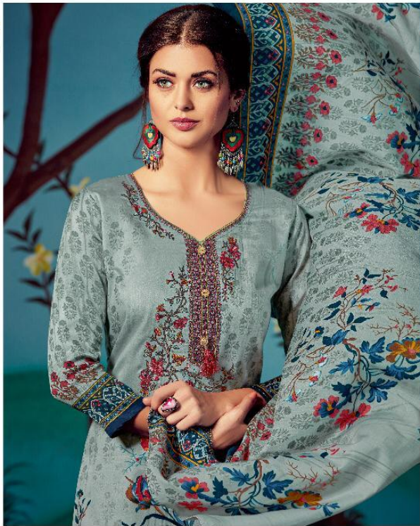
IT'S A BRILLIANTLY AFFORDABLE NEW LOOKS. NEUTRY PLACES. LOOK GRACEFUL. STYLISH. ELEGANT & SENSUOUS. 2004

Dressing well is a form of good manners.