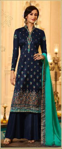
▲ 16301 ▲