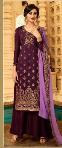
▲ 16305 ▲