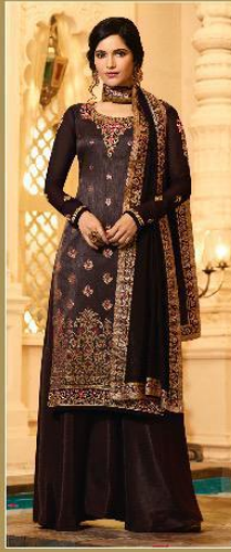
▲ 16302 ▲