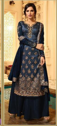
▲ 16306 ▲