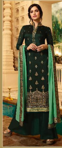
▲ 16304 ▲