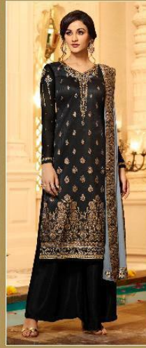
▲ 16303 ▲