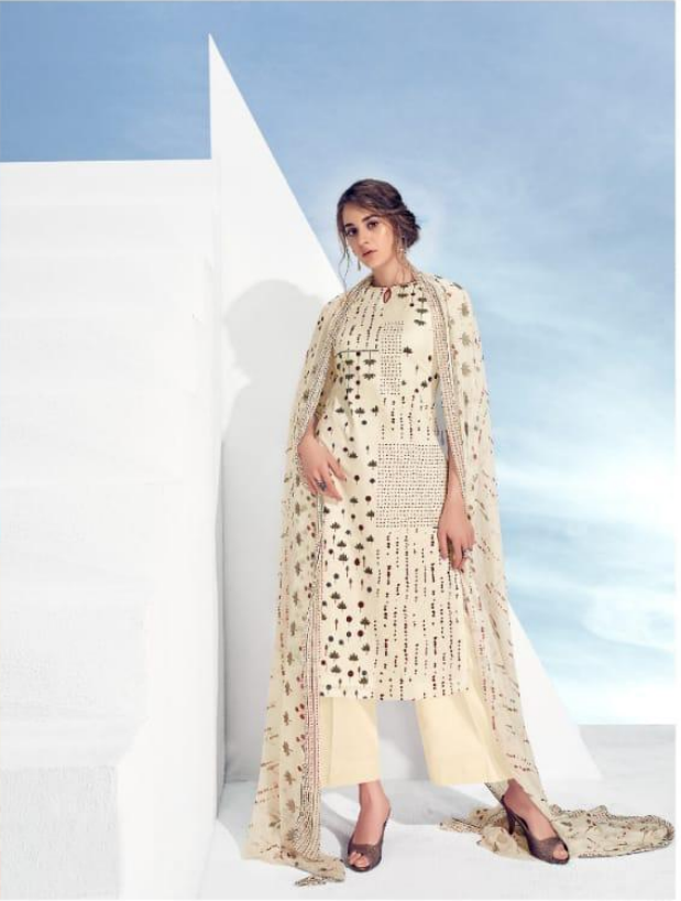
Since love grows within you, so beauty grows. For love is the beauty of the soul Inner beauty should be the most important part of improving one's self.