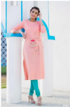
87001 - Light Peach rayon kurti with heavy embroidery on front and sleeves and head sequence work on the back. Length 47".