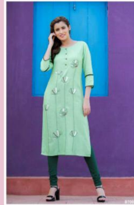
87007 - Light green rayon slub kurti with detailed embroidery on front and back, embroidery and pigmose lace on sleeves and fabric pigmose buttons. Length 46".