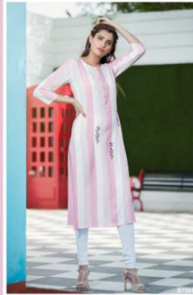
87006 - Light pink and white striped rayon with drop-down leaf embroidery hemline with sequence and pigmose buttons. Length 46".