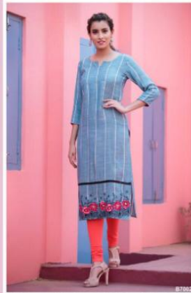
87002 - Blue and white striped rayon with detailed floral embroidery. Length 46".