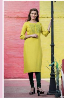
87004 - Lemonish green rayon dobby kurta with detailed embroidery on the chest and fabric pigmose buttons. Length 46".