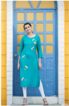
87005 - Turquoise blue rayon kurti with all over beautiful floral embroidery and wooden buttons on the placket. Length 47".