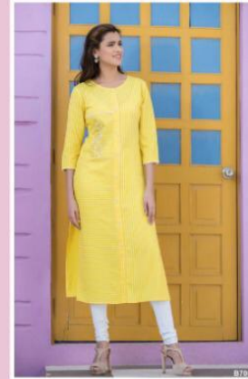
87008 - Yellow rayon white khadi print kurti with floral embroidery, pigmose lacework on body and sleeves and fabric pigmose buttons. Length - 47".