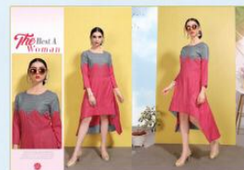
D. No. 1004