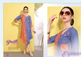
D. No. 1008