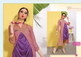
D. No. 1005