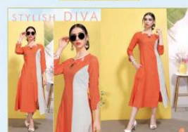
D. No. 1006