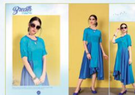
D. No. 1003