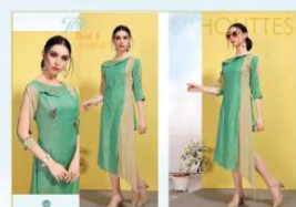
D. No. 1007