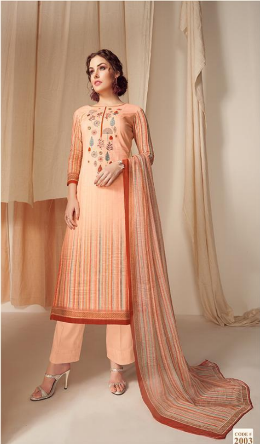
BEAUTIFUL STYLES TO GRAB YOUR HEART