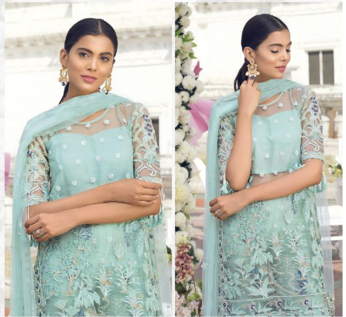
ESHAAL Vol-9 PREMIUM EMBROIDERED COLLECTION