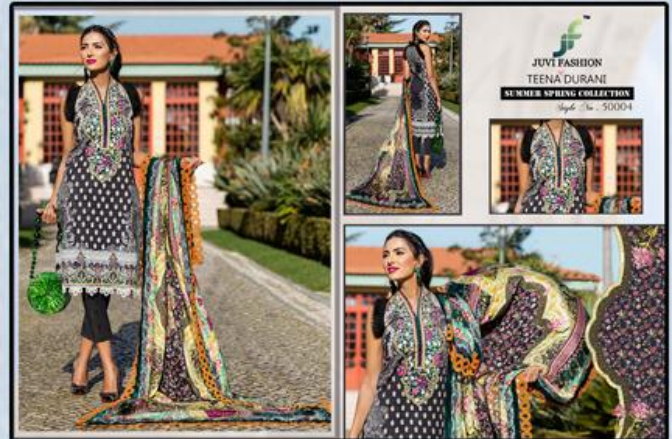
Style No . 50004