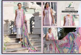
Style No. 50002