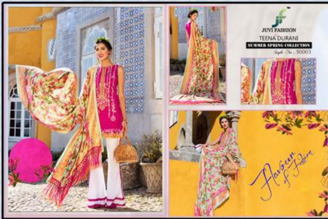
Style No . 50003