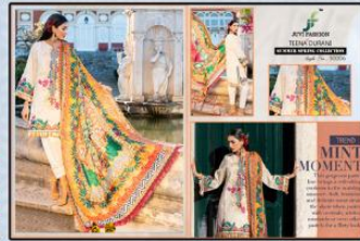
Style No. 50006