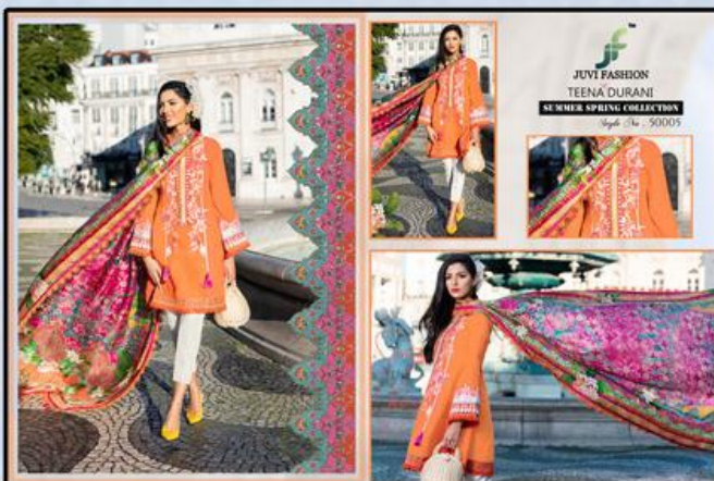
Style No . 50005