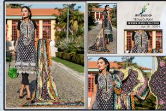
Style No. 50004