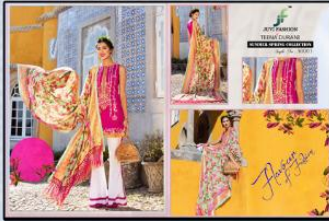
Style No. 50003