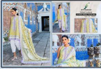
Style No. 50001