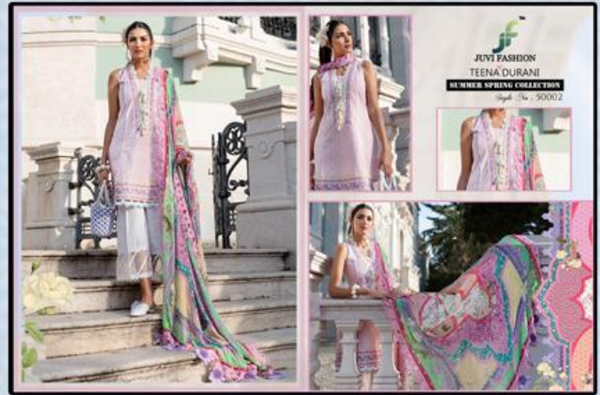
Style No . 50002