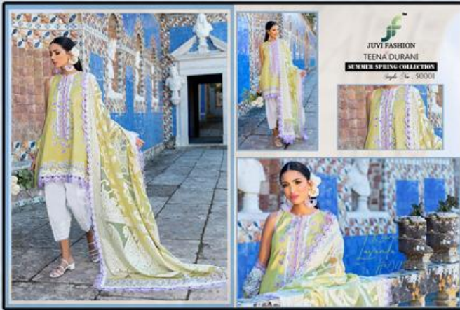
Style No . 50001