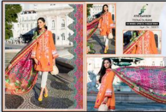
Style No. 50005