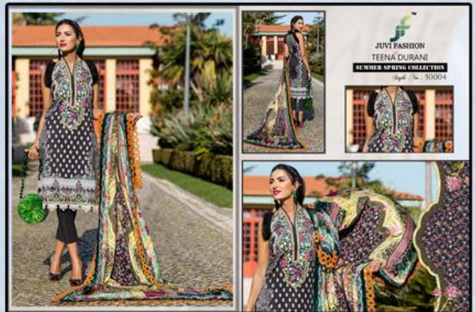
Style No . 50004