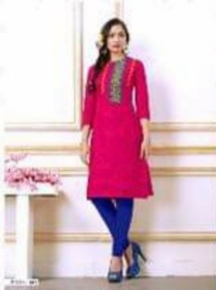
D.NO : 1009