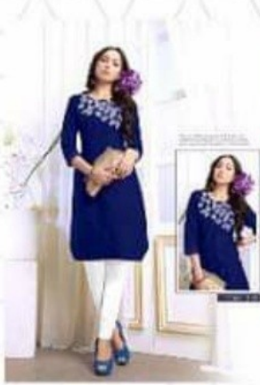
D.NO : 1001