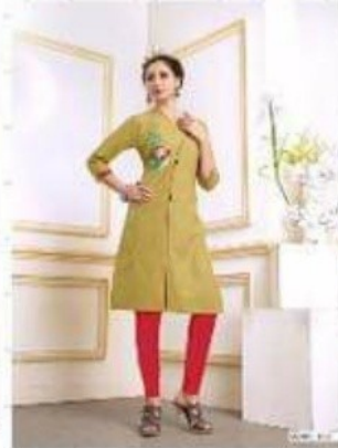
D.NO : 1007