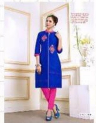
D.NO : 1010