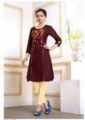
D.NO : 1008