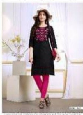
D.NO : 1006