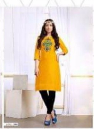
D.NO : 1004