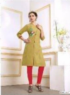
D.NO : 1007