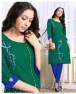
D.NO : 1002