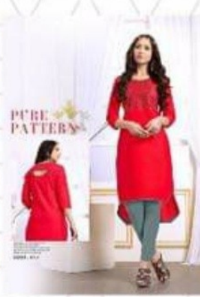
D.NO : 1003