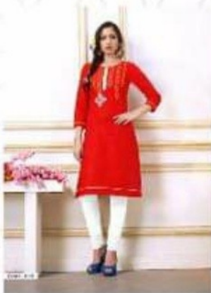
D.NO : 1005