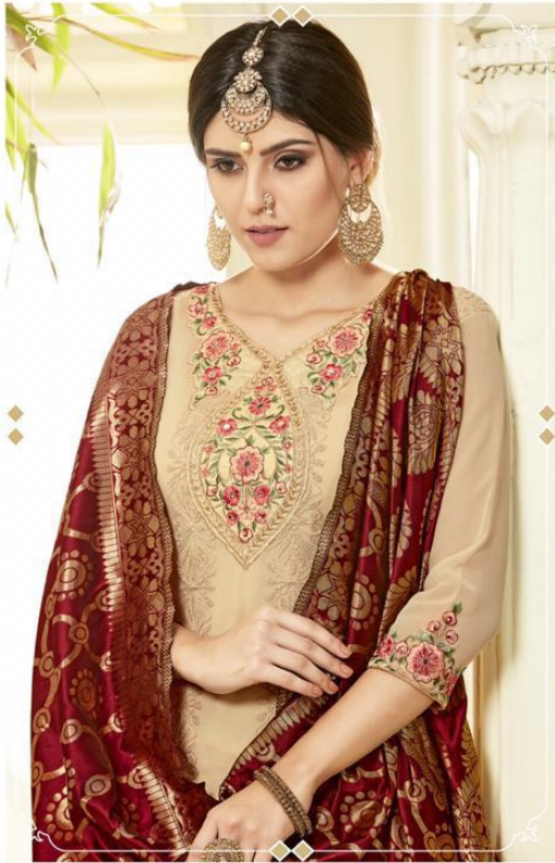
3008 This season marked with spathus fresh new cuts and stunning texture make personal style