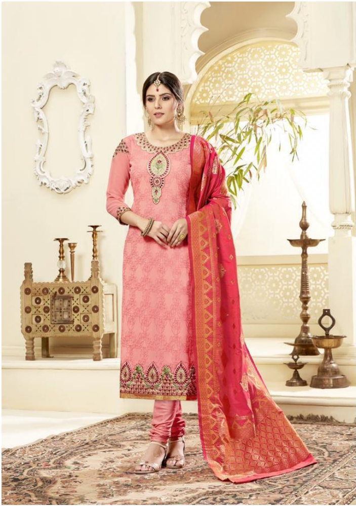
Classic Outfit instant