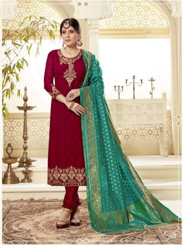
Fashion is inspire by youth & nostalgia & draws inspiration from the best of the past. I dress for the image, not for myself, not for the public, not for fashion, not for men.