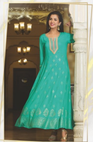
C3005 - Sea green gown with detailed hand painted rogan gold work on kalli all-around on the floor, heavy zari and resham embroidery on placket and sleeves.