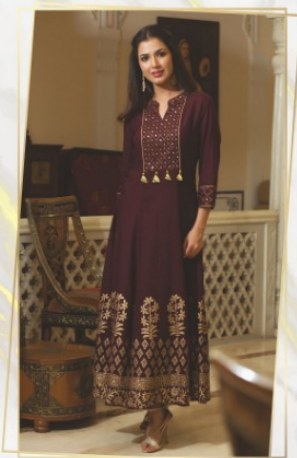
C3006 - Burgundy with heavy handblock gold all-around print on the floor and zari embroidery and sequence handwork on upper body and sleeves.