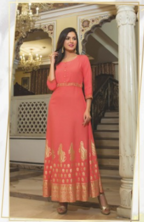
C3001 - Pink gown with heavy handblock gold all-around print on the floor and zari and resham embroidery around waist and sleeves.