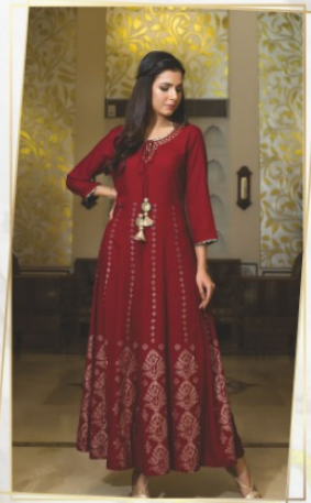
C3003 - Maroon gown with detailed hand painted rogan gold work on kalli all-around on the floor, sequence embroidery around neck with fustels and lacework around neck and sleeves.