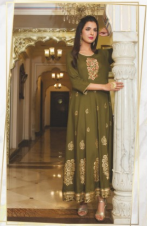
C3002 - Mehndi green gown with heavy handblock gold all-around print on the floor, zari and resham embroidery and triangle lace work around neck and sleeves