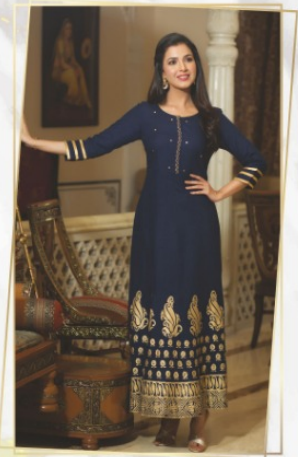
C3004 - Blue gown with heavy handblock gold all-around print on the floor, zari and sequence embroidery on upper body and gold lace work around sleeves.