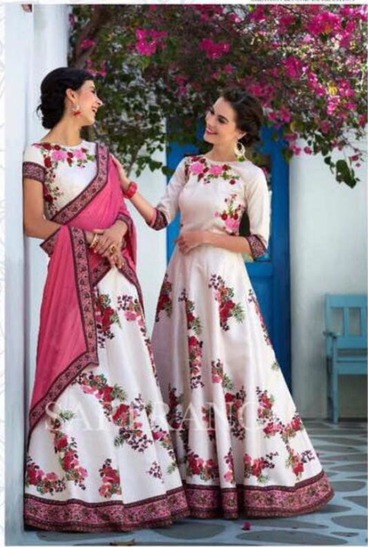
SL - 305