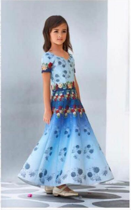
SL - 307