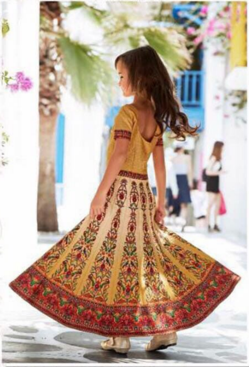
SL - 302