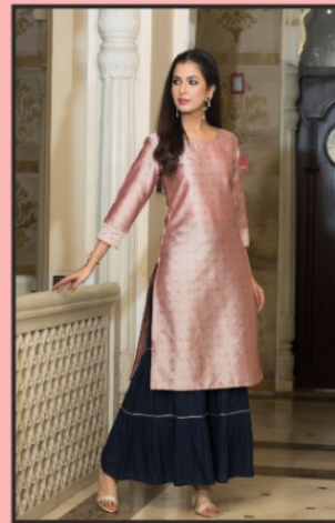
C2005 - Silk Kurli and Rayon Sharara Set - Kurli with self-meena built weaving and sharara with gola lace work.