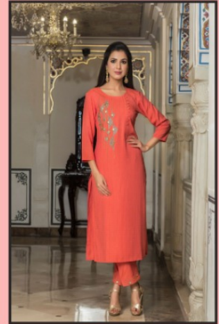
C2003 - Viscose Rayon Silk Dobby Kurli and Pant Set - Kurli and pant with zar and mirror (sheet) embroidery.