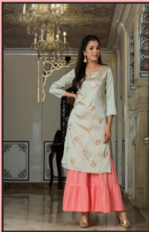
C2004 - Zorba Silk Kurli and Rayon Sharara Set - Kurli with zar embroidery and coin handwork. Sharara with gola lace work.