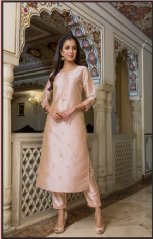
C2001 - Zorba Silk Kurli and Pant Set - Kurli with all-over sequence work and zar embroidery pocket and sleeves. Matching pant with zar embroidery.