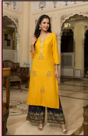
C2002 - Two Tone Rayon Dobby kurli and Rayon Palazzo Set - Kurli with leather zar embroidery and gold foil print palazzo.