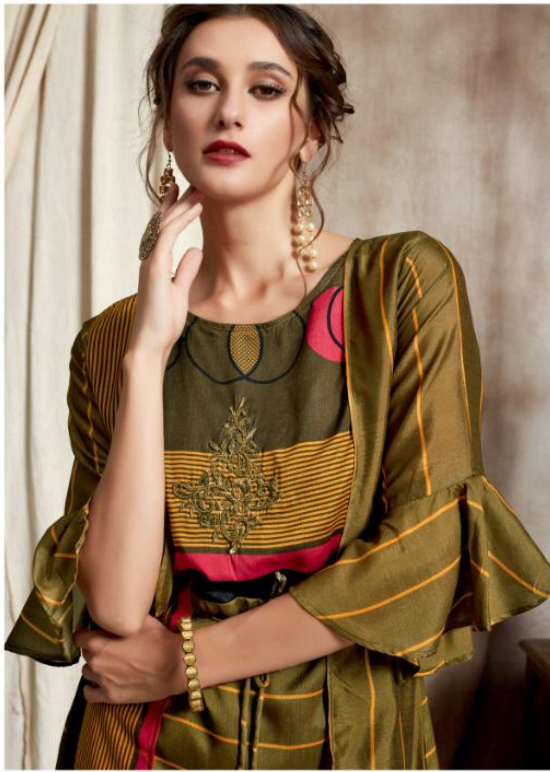
When we chose to take inspiration from Indian beauty, the result is here a set of vivid colourful designs told a story about great fashion and trends.