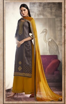
D No 10078