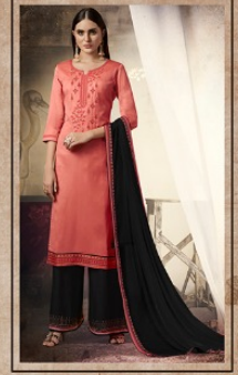
D No 10076