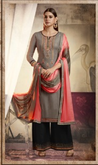
D No 10073