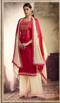
D No 10074