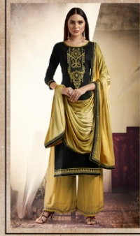
D No 10075