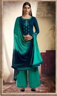
D No 10071