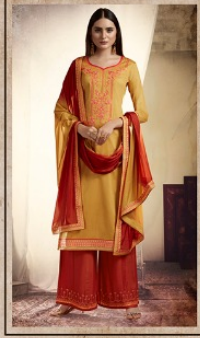
D No 10072