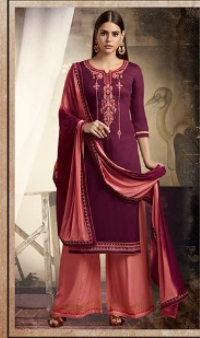
D No 10077