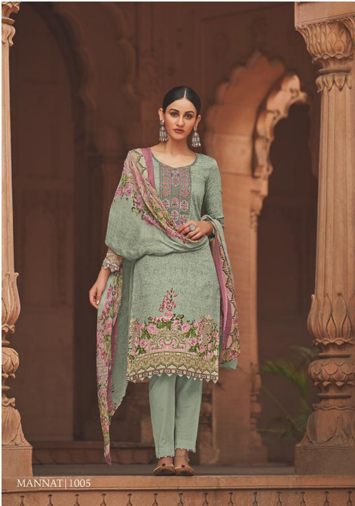
MANNAT | 1005