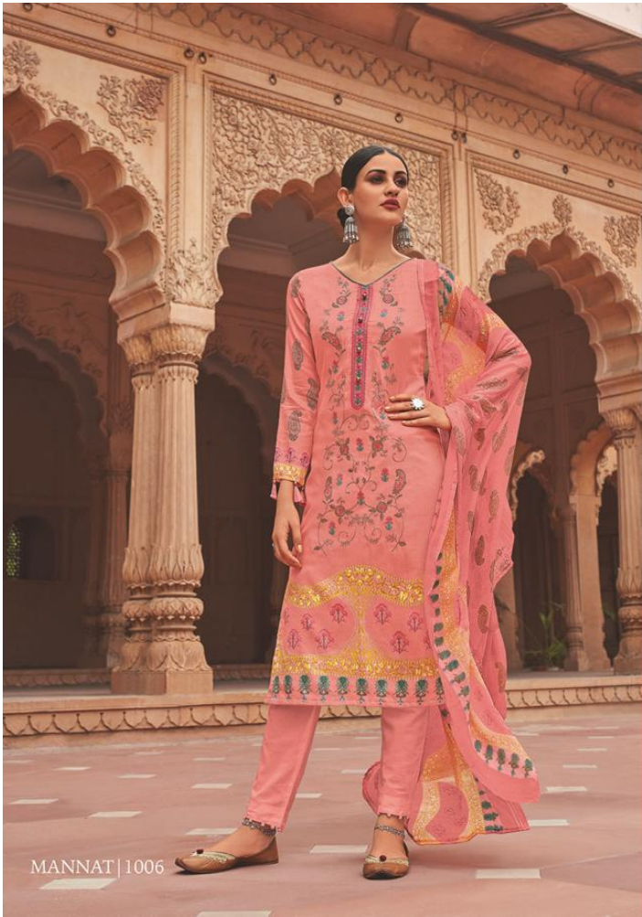
MANNAT | 1006