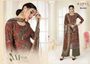
CODE / 8254