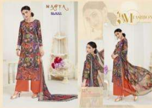
CODE / 8248