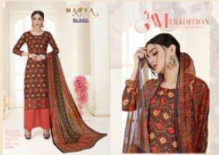
CODE / 8250