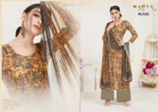
CODE / 8247