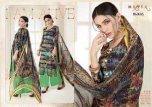
CODE / 8251