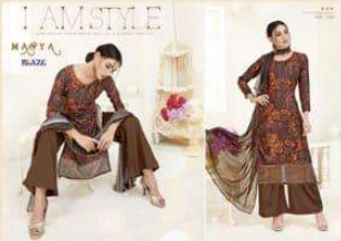
CODE / 8249