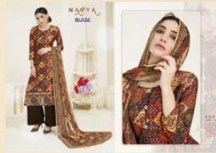
CODE / 8253