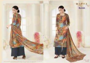
CODE / 8255