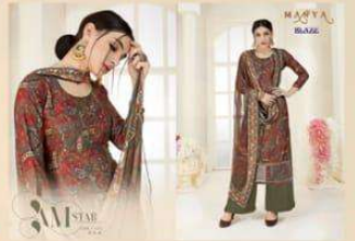
CODE / 8254