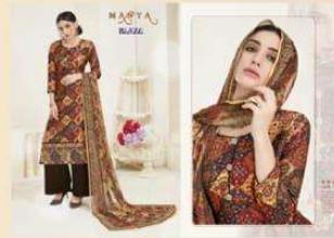
CODE / 8253