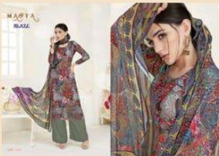
CODE / 8252