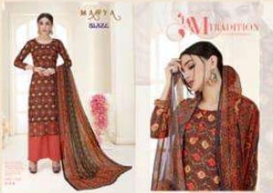
CODE / 8250