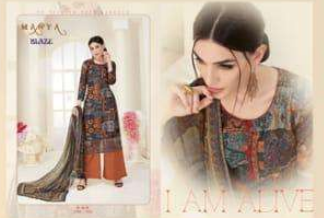
CODE / 8256