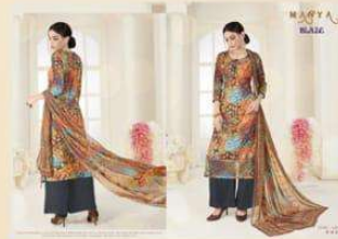
CODE / 8255