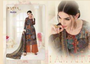
CODE / 8256