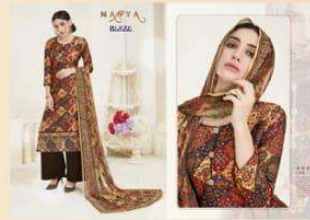
CODE / 8253