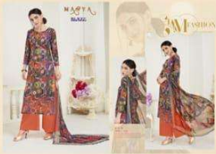
CODE / 8248