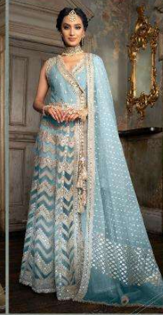
Design Number 3001 E