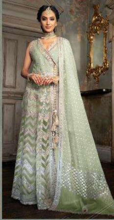
Design Number 3001 B