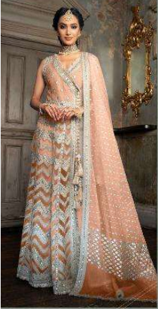
Design Number 3001 A