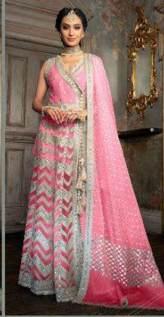
Design Number 3001 C