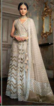
Design Number 3001 D