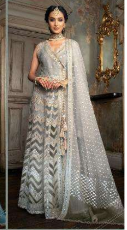
Design Number 3001 F