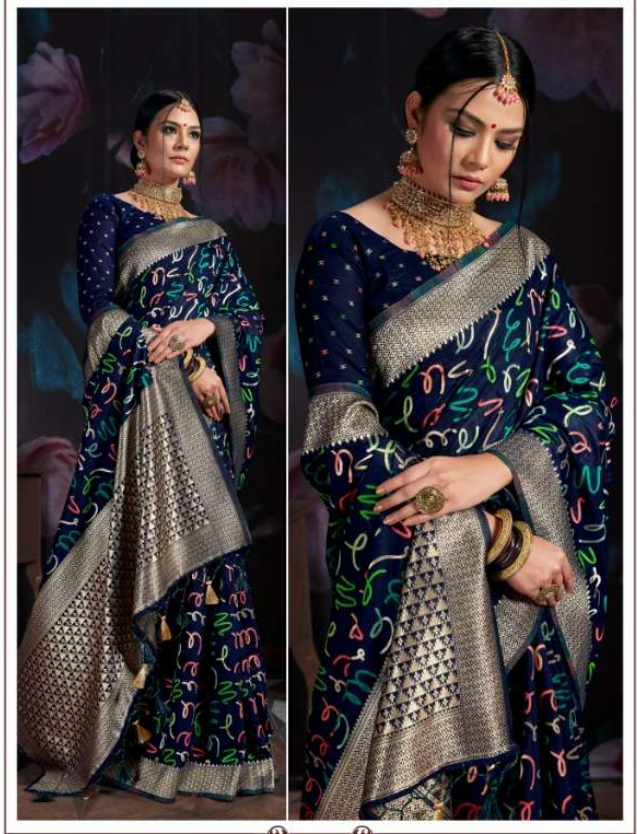
Bright red with blue combination... a very vibrant energy highlighting different shades... contemporary yoke design with chevron border to edge... a perfect design for any occasion any time...