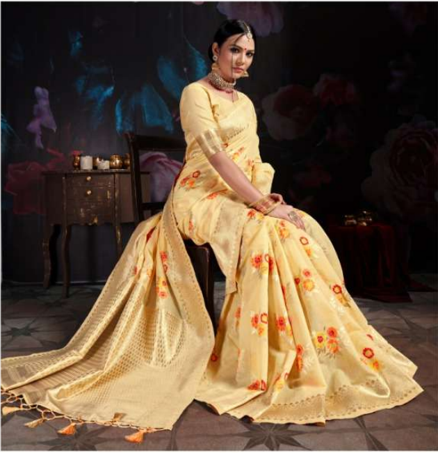
Be a center of attraction in any occasion in this beautifully printed designer saree.