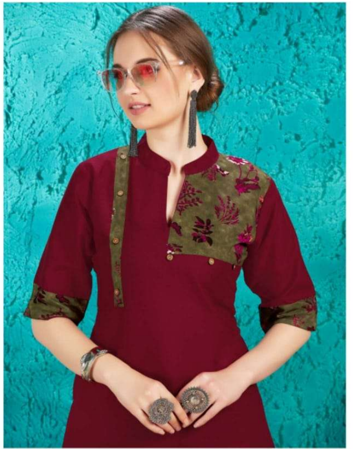
with a unique creation, merging delicate femininity into modern touch.