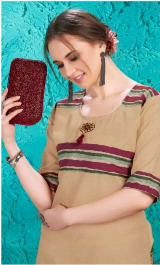
...and vibrant design will enrich your wardrobe with refreshingly soothing colours of the nature.