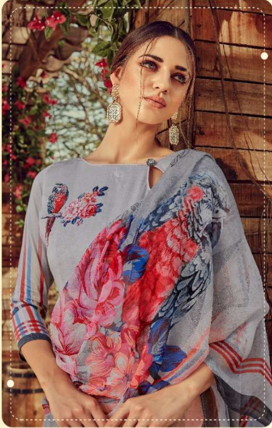
A woman's dress should be like a barbed-wire fence, serving its purpose without obstructing the view