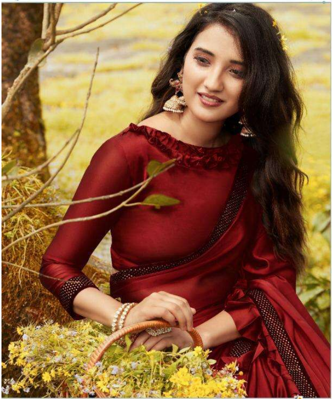
ASTONISHING SAREE IN CLASSIC STYLE OF INDIAN SAREE IS ONE OF THE FINEST AND MOST PURCHASED FORMS OF SAREE