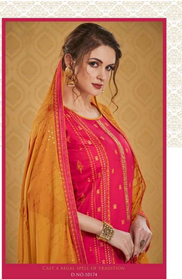
CAST A REGAL SPELL OF TRADITION. D.NO.10174