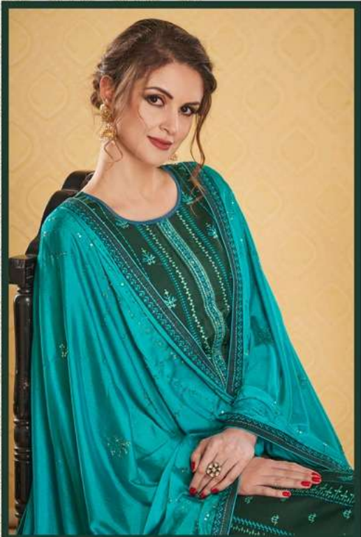
CAST A REGAL SPELL OF TRADITION. D.NO.10177