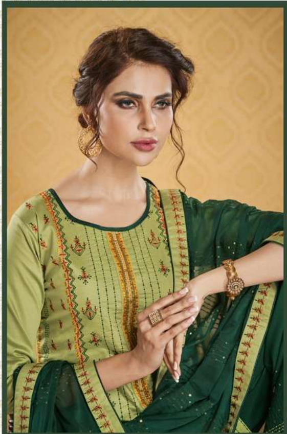
CAST A REGAL SPELL OF TRADITION. D.NO.10171