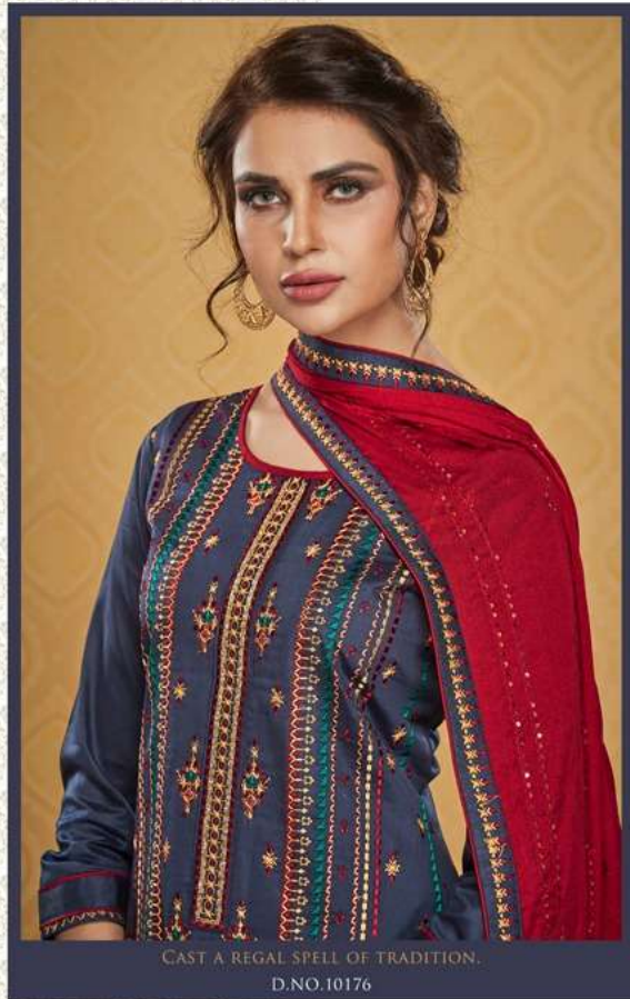
CAST A REGAL SPELL OF TRADITION. D.NO.10176