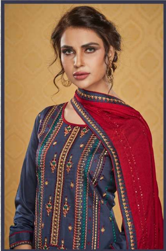
CAST A REGAL SPELL OF TRADITION. D.NO.10176