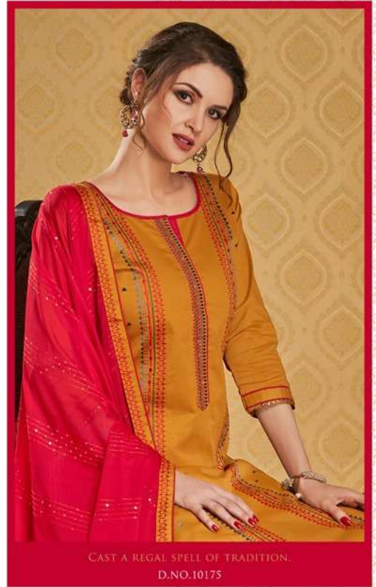
CAST A REGAL SPELL OF TRADITION. D.NO.10175