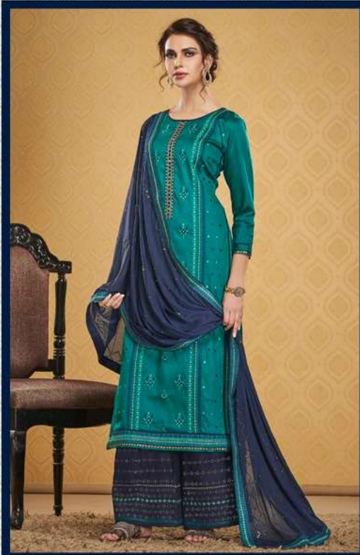
CAST A REGAL SPELL OF TRADITION. D.NO.10173