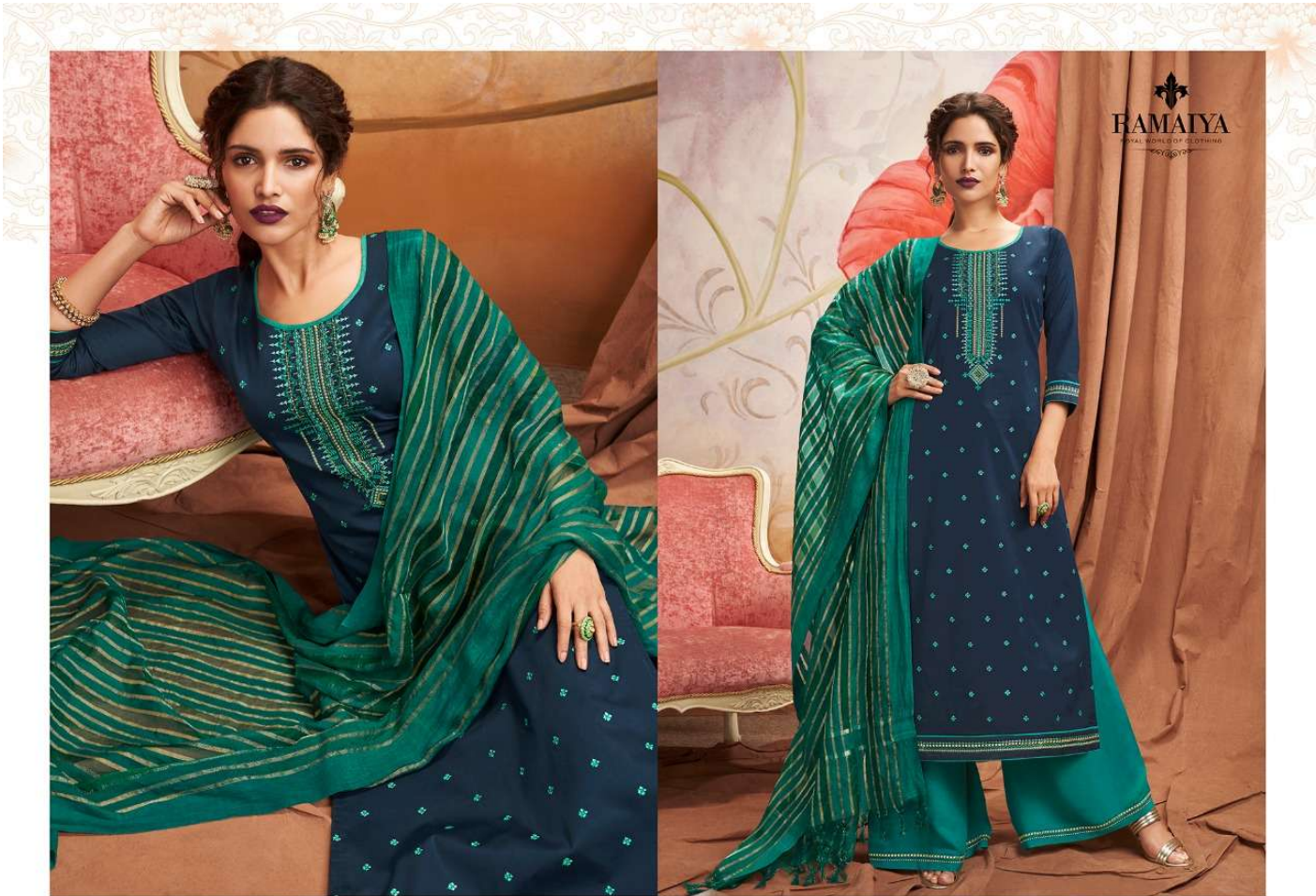
Exotic hues & natural fabrics make for soft classic look to your beauty.