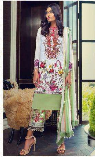
D.N 1003 NX