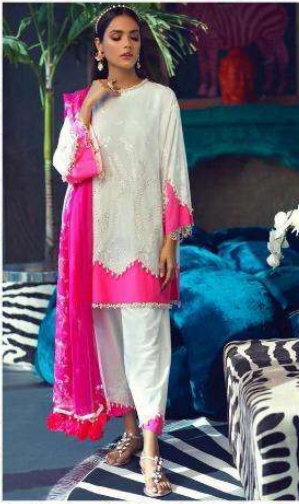
D.N 1001 NX