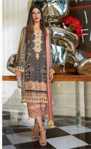
D.N 1002 NX