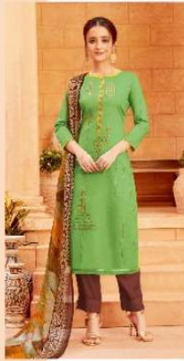
*** D.No.2006 ***