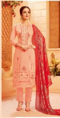
*** D.No.2003 ***