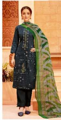
*** D.No.2010 ***