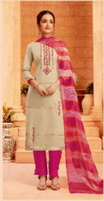
*** D.No.2005 ***