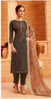
*** D.No.2004 ***