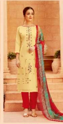
*** D.No.2008 ***