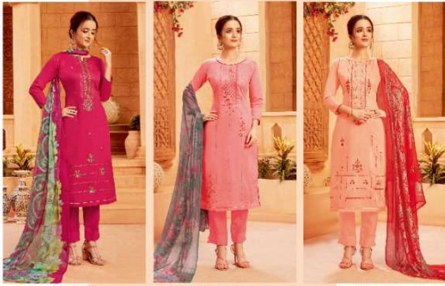
*** D.No.2001 ***