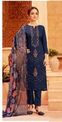
*** D.No.2007 ***