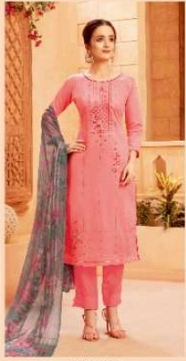
*** D.No.2002 ***