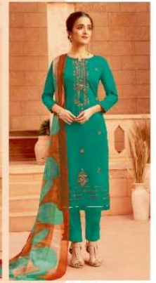
*** D.No.2009 ***