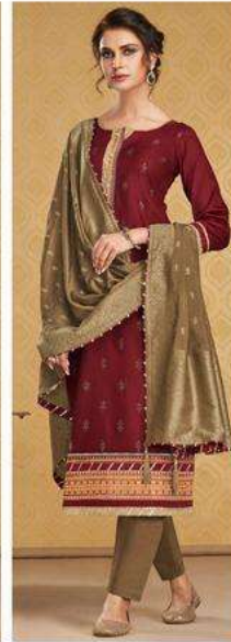
D.NO - 135