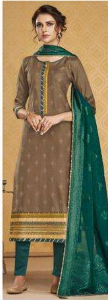
D.NO - 132