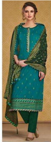
D.NO - 134