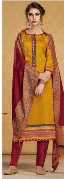
D.NO - 133