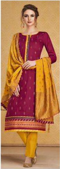
D.NO - 131