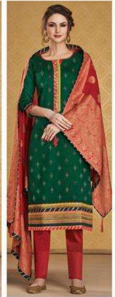
D.NO - 136