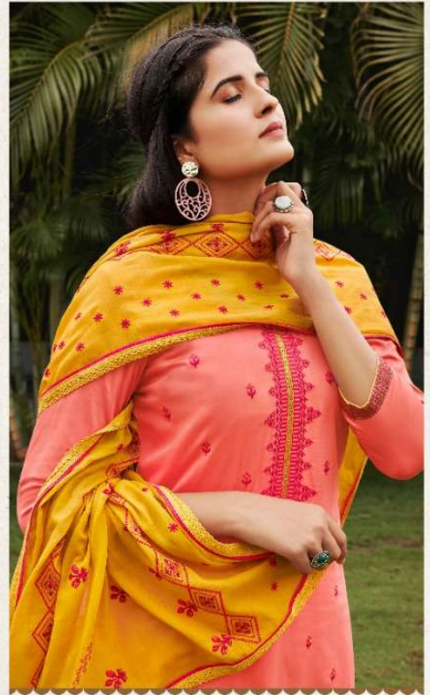
The collection was a perfect blend of Indian silhouettes & contemporary style. 5528-