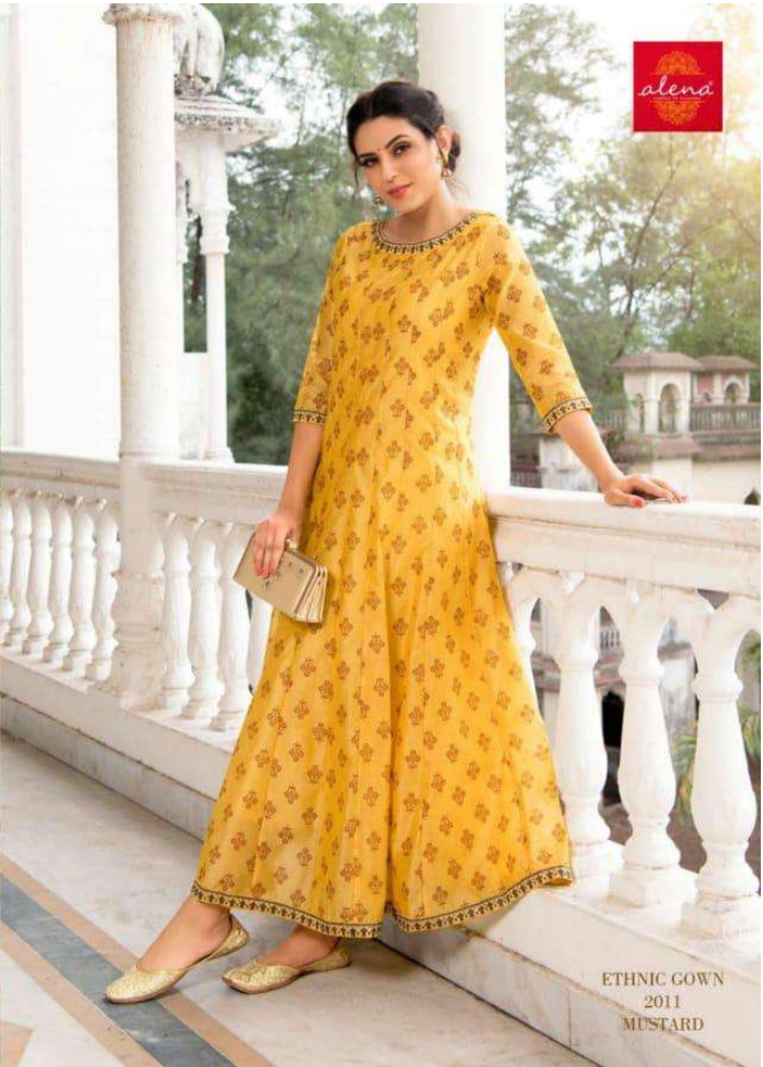
ETHNIC GOWN 2011 MUSTARD