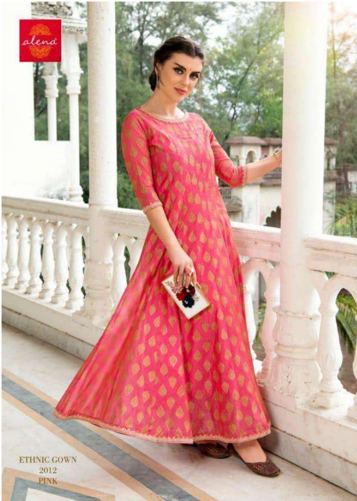
ETHNIC GOWN 2012 PINK