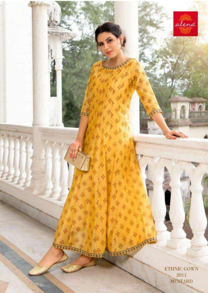
ETHNIC GOWN 2011 MUSTARD