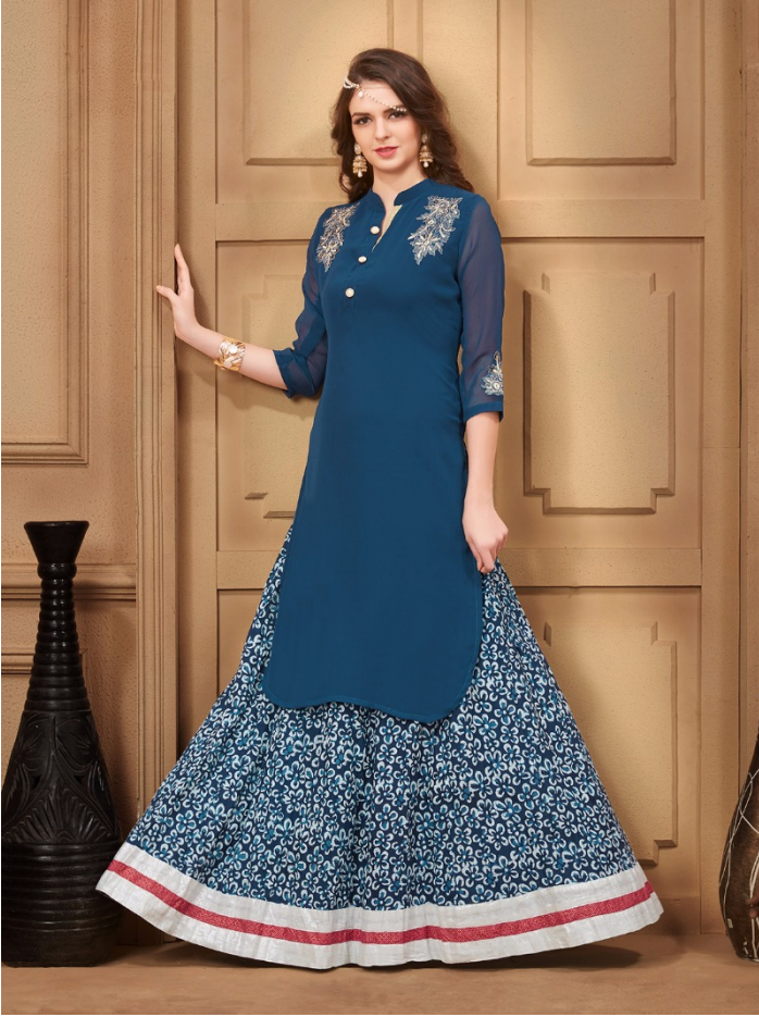
Indian women are specially found wearing Kurtis in the functions like social gathering, engagement, wedding and festivals.