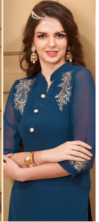
• D.No.1208 •