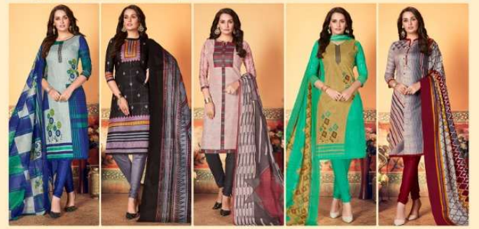
D.No. 5001 D.No. 5002 D.No. 5003 D.No. 5004 D.No. 5005