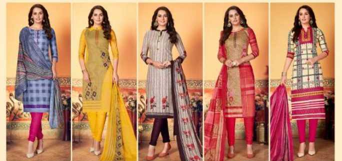
D.No. 5006 D.No. 5007 D.No. 5008 D.No. 5009 D.No. 5010