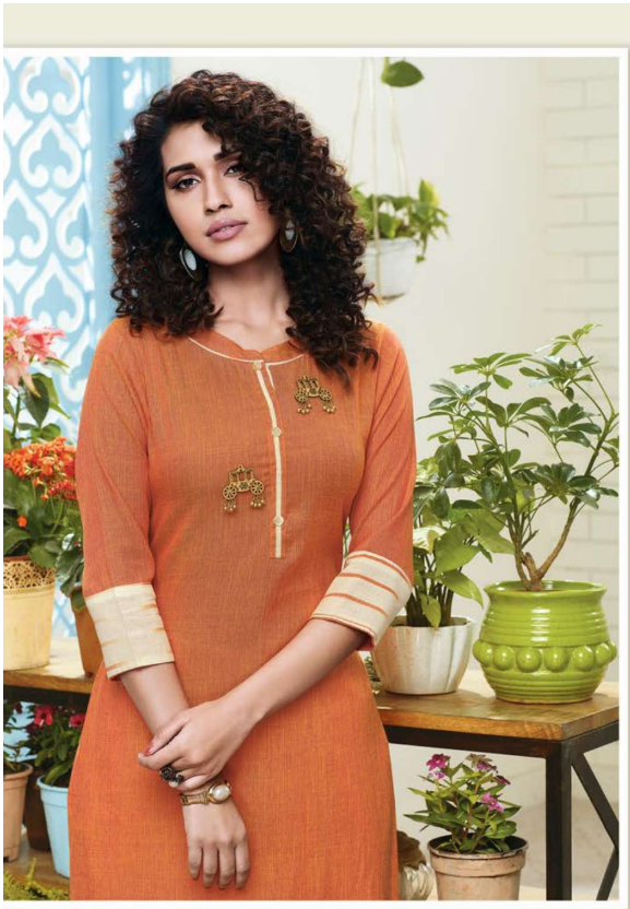
S-1016 "I wear my sort of clothes to save me the trouble of deciding which clothes to wear."