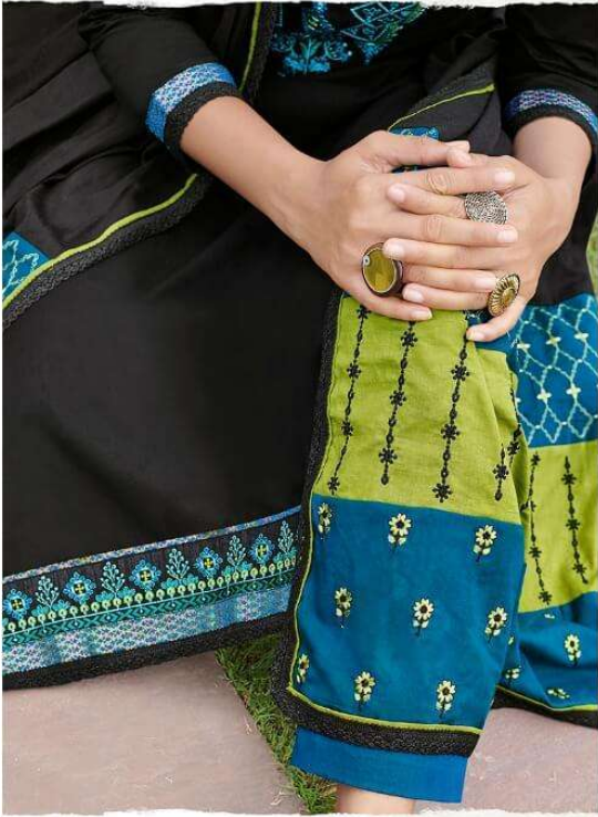
Different cultures come together in a tribute to fashion's biggest moment this season.