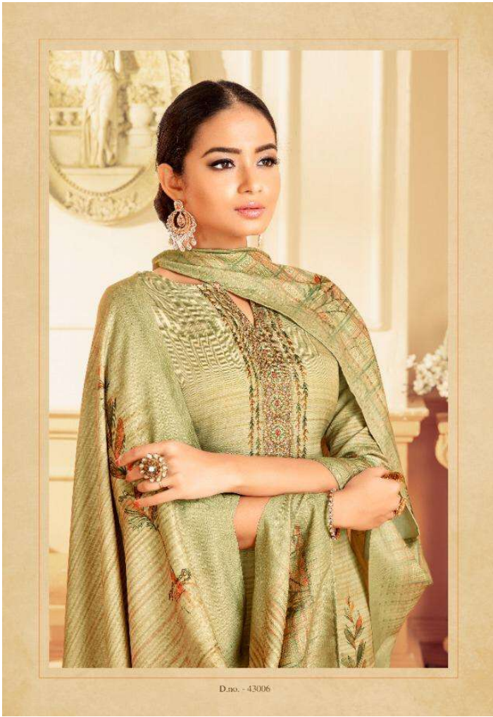
D.no. - 43006