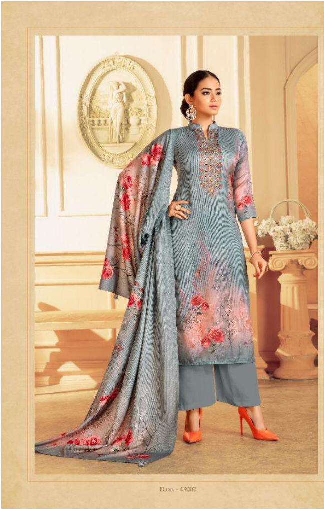
D.no. - 43002