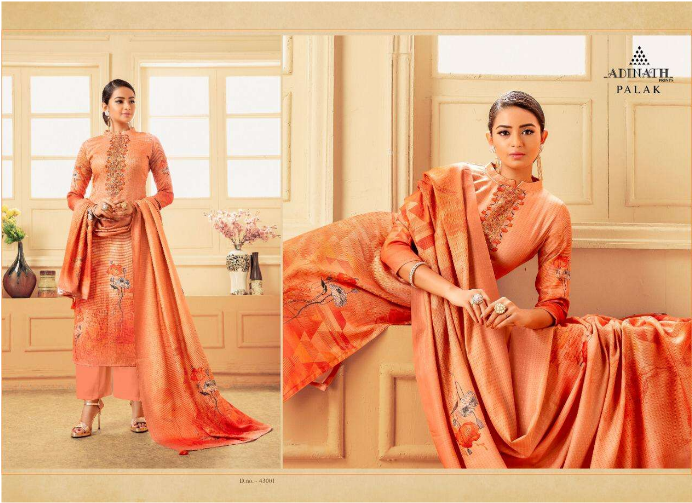
D.no. - 43001