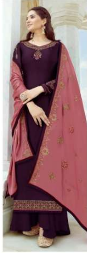
ALISA - SANCHI