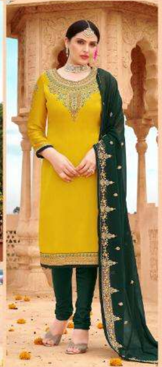
D. NO - 1011