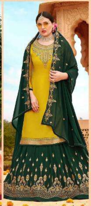
D. NO - 1011