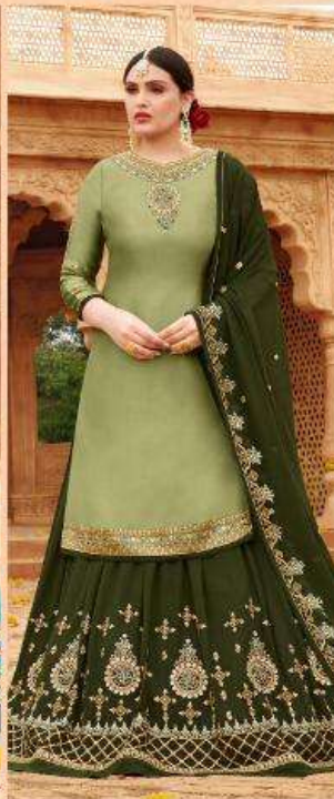
D. NO - 1009