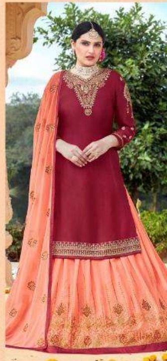
D. NO - 1010