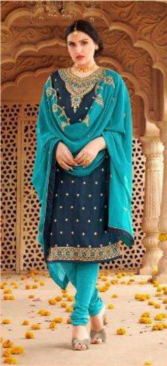
D. NO - 1008