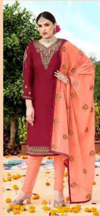
D. NO - 1010