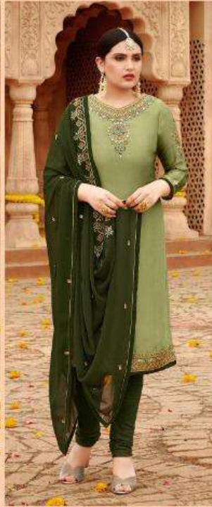
D. NO - 1009