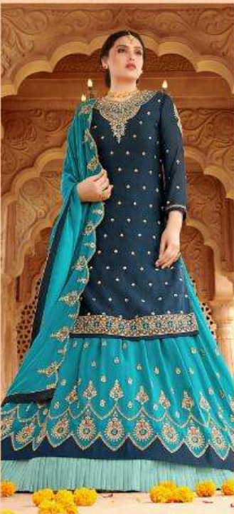
D. NO - 1008