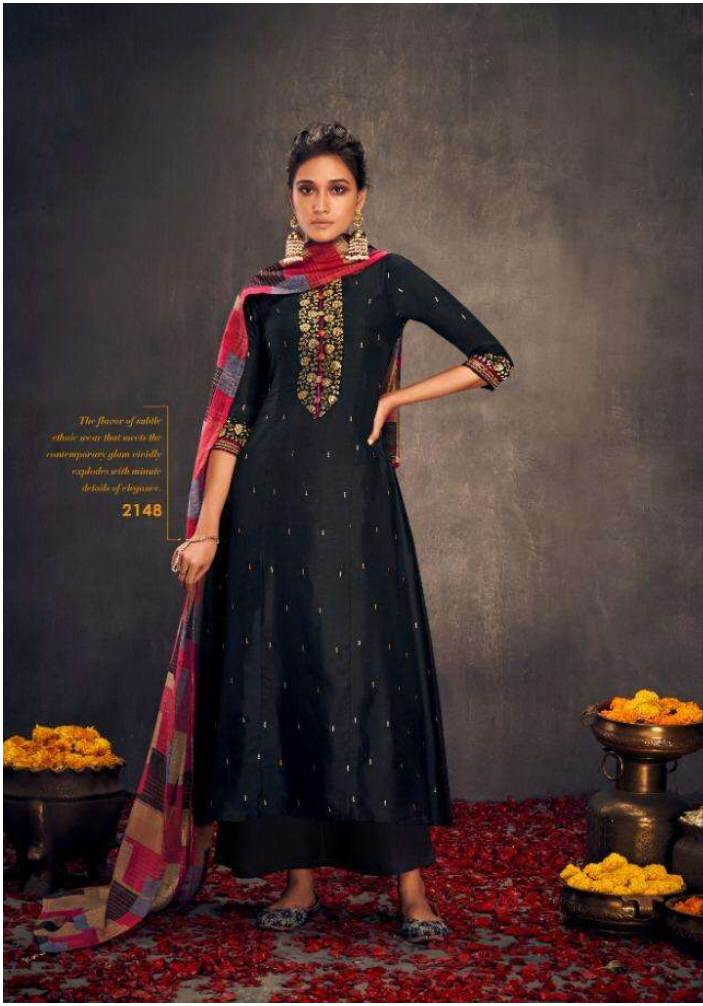
The flavor of subtle ethnic wear that meets the contemporary glam visibly explodes with minute details of elegance.