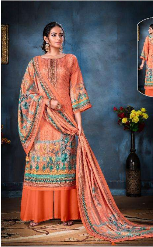
The image shows a woman wearing a traditional Indian outfit. The outfit consists of a long-sleeved, floor-length kurta in a vibrant orange color, adorned with intricate green and gold floral patterns. A matching shawl is draped over her shoulders, featuring a wide border with a geometric pattern. The woman is standing in a studio setting with a dark blue background and a vase of flowers. An inset image shows the back view of the outfit, highlighting the detailed embroidery on the sleeves and the back of the kurta.