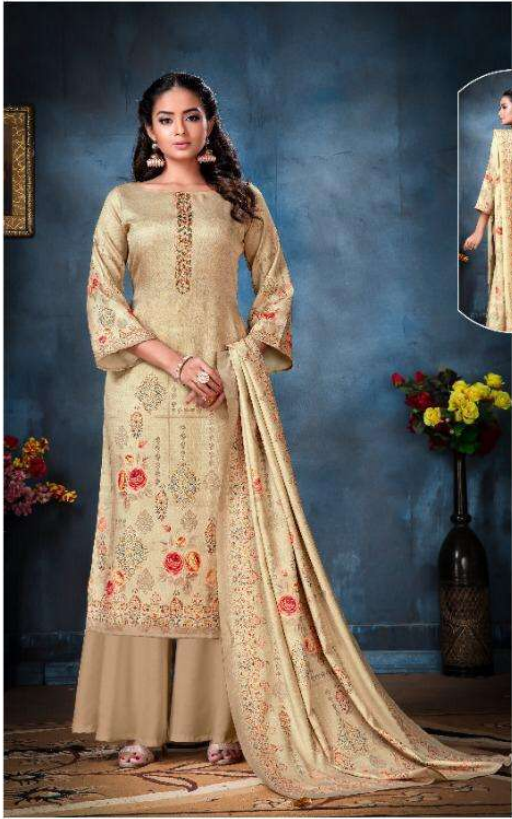
The image shows a woman wearing a light beige, long-sleeved, floor-length dress with intricate floral embroidery in red, green, and gold. The dress has a high neckline and a long, flowing dupatta. An inset image in the top right corner shows a side view of the same outfit. The background is a dark blue wall with a vase of yellow and red flowers.