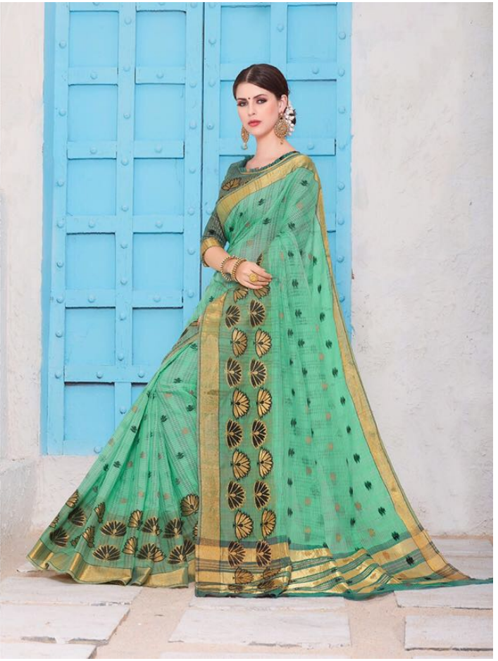
Embrace the high voltage, exuberant hues of the season...