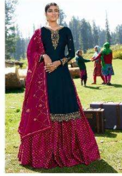
◆ 21305 ◆