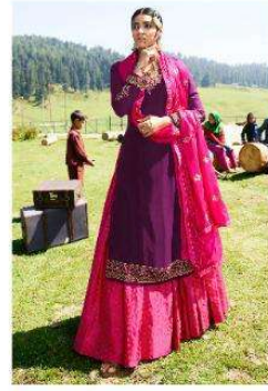
◆ 21306 ◆