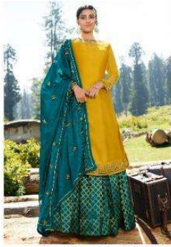
◆ 21304 ◆