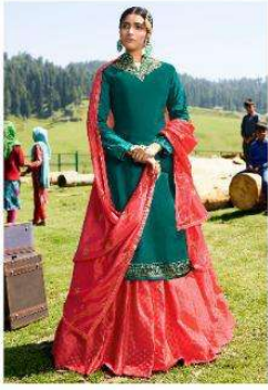
◆ 21301 ◆