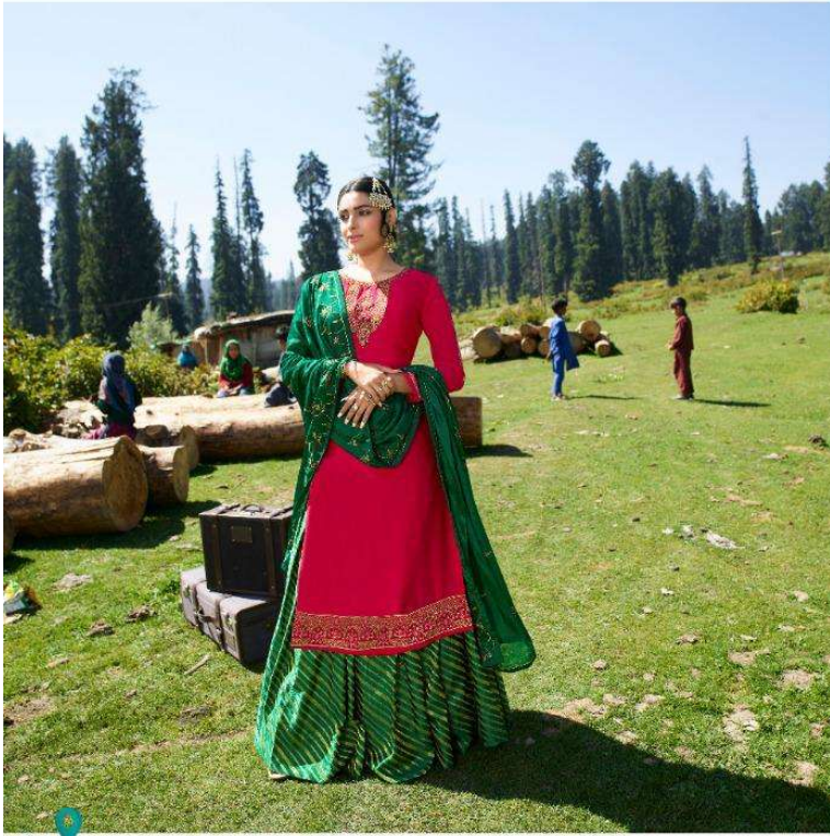
The soulful art