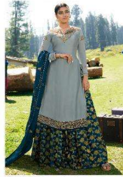
◆ 21307 ◆