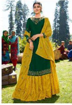
◆ 21302 ◆