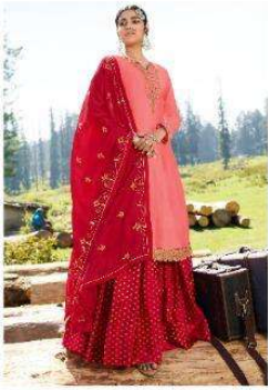
◆ 21303 ◆