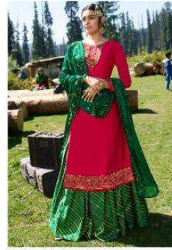
◆ 21308 ◆