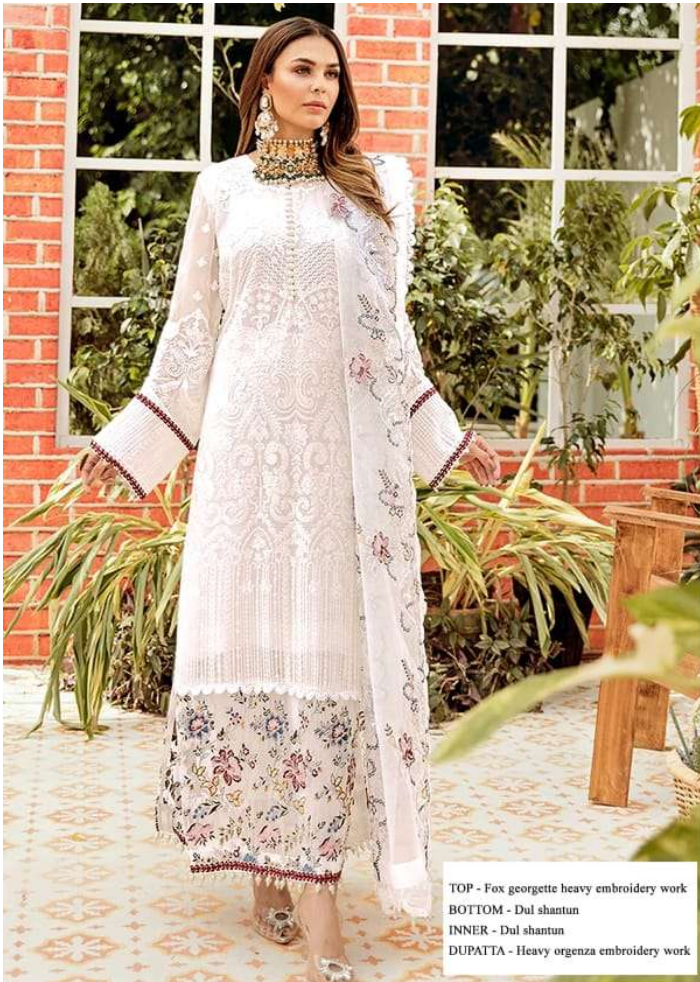
TOP - Fox georgette heavy embroidery work BOTTOM - Dul shantun INNER - Dul shantun DUPATTA - Heavy orgenza embroidery work