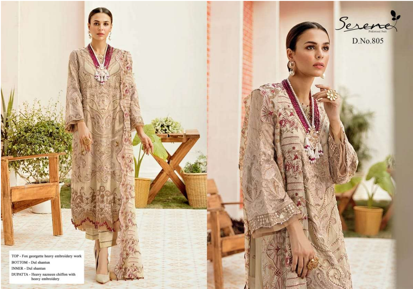
TOP - Fox georgette heavy embroidery work BOTTOM - Dul shantun INNER - Dul shantun DUPATTA - Heavy nazneen chiffon with heavy embroidery