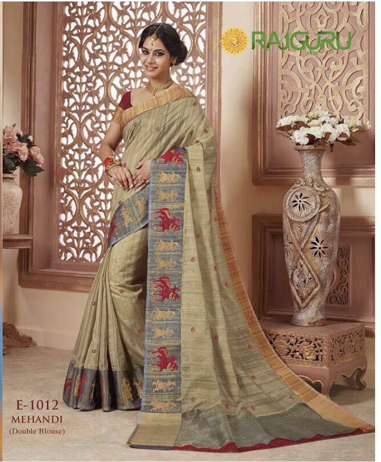
E-1012 MEHANDI (Double Blouse)