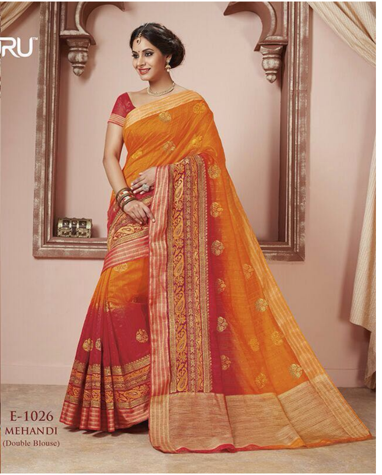
E-1026 MEHANDI (Double Blouse)