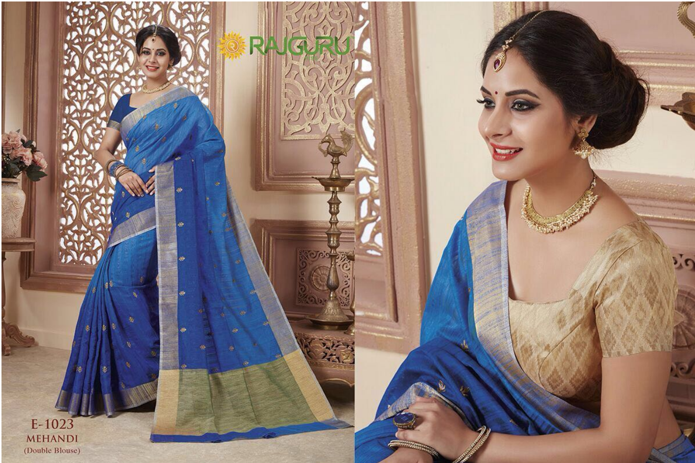
E-1023 MEHANDI (Double Blouse)