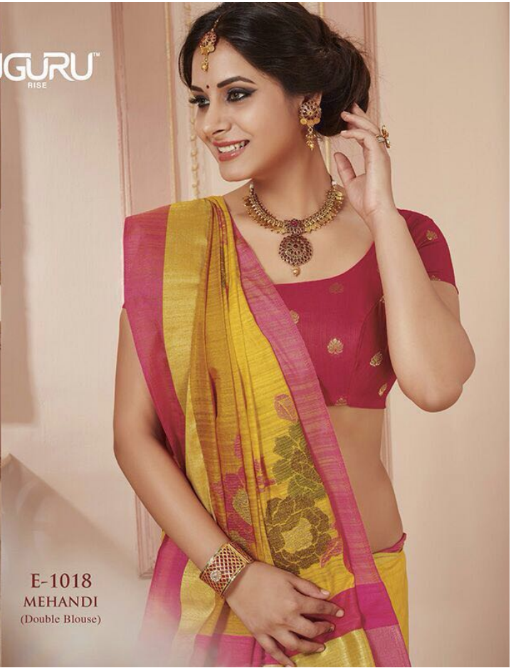
E-1018 MEHANDI (Double Blouse)