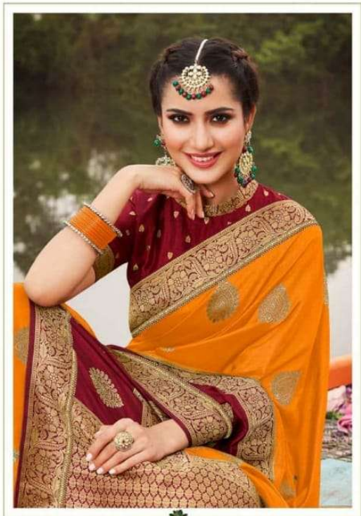
The glimmer in something really will fulfill all the requirements for glossy & trendy look.