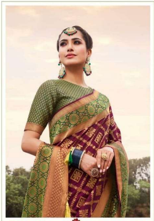
everything you need to retreat, your favorite traditions from. Sarees drapes to the color range of the season.