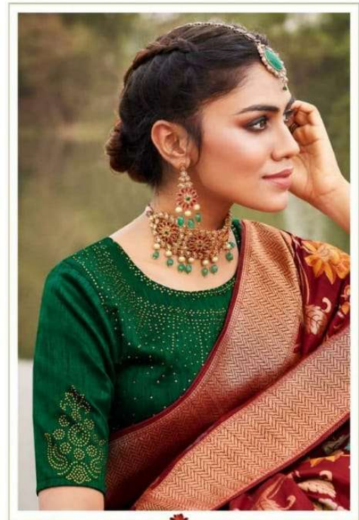
Resistant fabric of traditional sarees give you a new makeover this season.